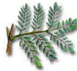
compound: doubly pinnate